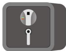
Safe or lockbox for handguns

Gun safes can lower the risk a curious child will be hurt: