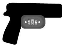
Gun trigger locks— inexpensive and effective