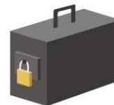
Lock box for ammo